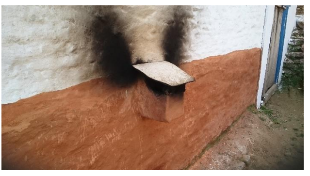
Clear indication: there is a stove in this house

Time and again we noticed chimneys poking out of house walls. Occasionally we stopped to question people in their homes. We were always greeted by happy housewives during these spontaneous visits. They were eager to show us their well-kept stoves. We were even presented with a bag of mandarins in thanks for our work when we left!