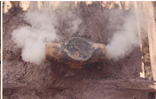
Smoke leaving through the outlet

It’s a big surprise when people learn that they can cook without the smoke which has plagued them and their families for generations. The idea of a outlet or a chimney is new and we are often thanked for sharing the concept.