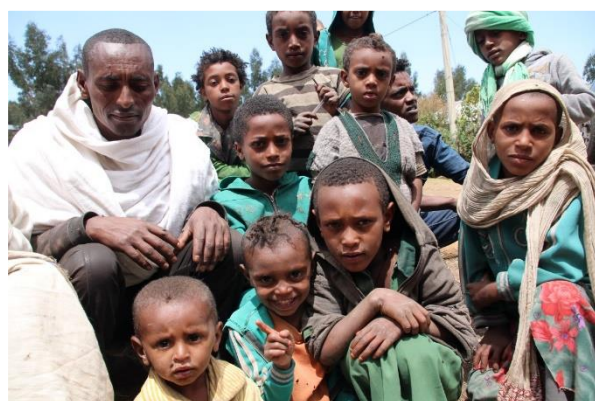
Many people came to see what we were doing

and other cooking pots. Pottery has deep roots in Amhara. Nonetheless it took a lot of discussion and several attempts till the potters managed to make the outlets in the form that we need.