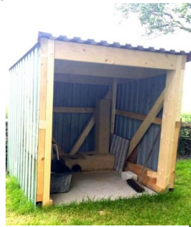
Safe and sound

4844-230 to register a visit. Anyone wishing to can stay for longer as the Zetls also have holiday flats - now with an additional attraction!