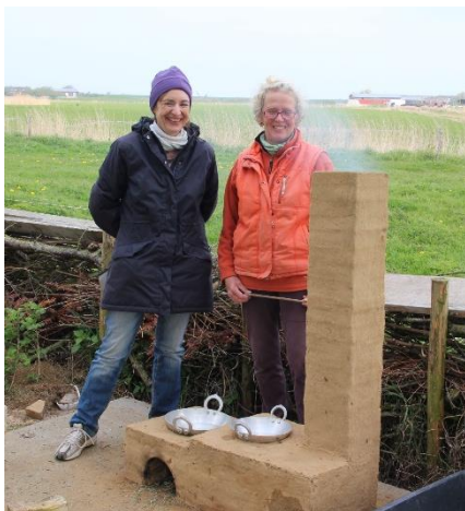
First firing: all ok!

In the meantime the Zetls have built a hut around the oven to protect it from the elements. Now everything is ready; so visitors whether islanders and tourists, can experience first-hand how a Nepalese clay stove works and how to prepare dal bhat on it.