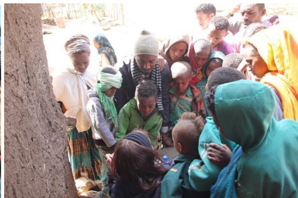
a chance for us to explain

Clay can be found in every village; though we sometimes had to search hard with the villager to find good quality clay. People carried the clay to the villages on their shoulders; or occasionally with donkeys. Finding good sand was more of a challenge. Sand is plentiful in the river