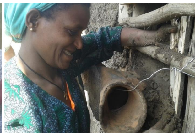
Fixing the Outlet