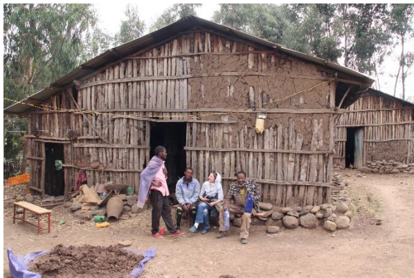
House in Milligebssa, Simien Mountains

The communities around the park are possibly the poorest and most remote in Ethiopia. With altitudes of up to 3500m crop yields are low. Grazing land is nearly barren; so cattle are not really an option. The only tarred road connects Debarq with the south of the country. Many villages are several days' walk from the road. Life is simple there and continues more-or-less unchanged as it was hundreds of years ago.