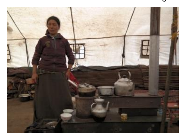
Mustang: Metal stove in a yurt

My second trip in early summer took me to the distant kingdom of Mustang; today part of Nepal. This was my first visit there; despite my long relationship to Nepal. Together with two friends and a professional guide I spent nearly three weeks in the high valley behind the Kali Ghandaki Canyon and saw the masked dances of the buddhist monks for the Tiji festival in Lo Mantang. Enormous monasteries and oasis-like villages were dotted amongst unforgettable landscapes.