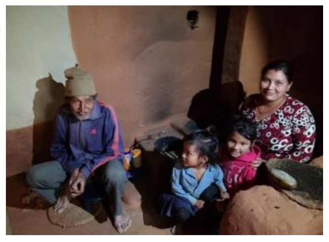
Family with a new stove in Pyuthan

In November a we visited the district to review the results. Twenty stove makers were presented with their certificates after building 150 stoves. An extensive discussion with the men and women working on site was very valuable, and made clear the value of the close co-operation with the local authorities. The difficulties which the stove makers face as guests in the villages could also be discussed. Persuading people of the advantages of the smoke-free cooking stoves is not always successful. We also had the possibility to observe the building and installation of a stove from start till finish. The stove makers build their first 150 stoves after their training under supervision of an experienced colleague; it was a