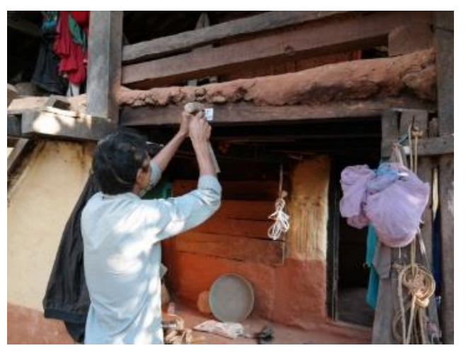
Attaching the stove ID to a house

could be rebuilt. The authorities in Kavre and Ramechhap often only certified "limited damage" resulting in a reduction of the, in any case, meagre financial support. In consequence many people are only making minimal repairs and living with the result. According to official figures reconstruction has not started for 85% of the impacted houses, even now, two years after the earth quakes. Our stove makes are also often impacted; nonetheless they keep in touch with villagers in their region and offer support in installing a new stove whenever possible.